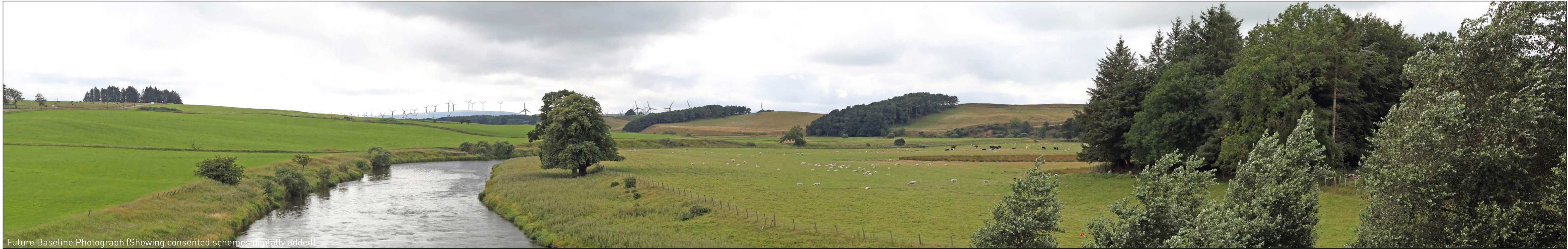
Future Baseline Photograph (Showing consented schemes digitally added).