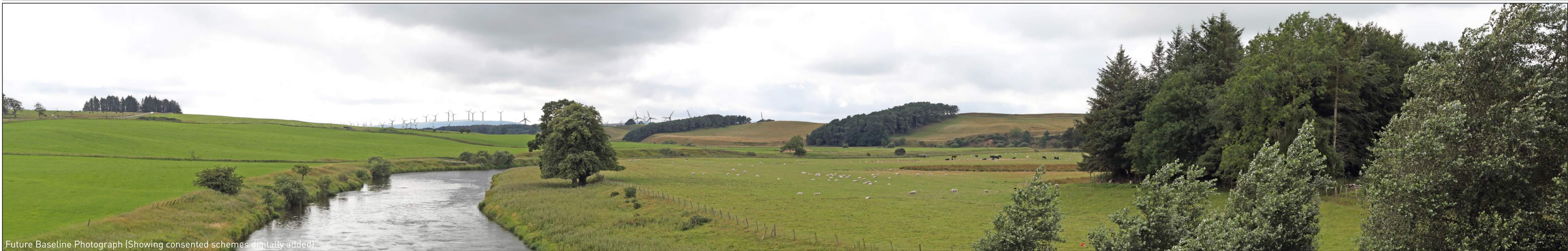
Future Baseline Photograph (Showing consented schemes digitally added)