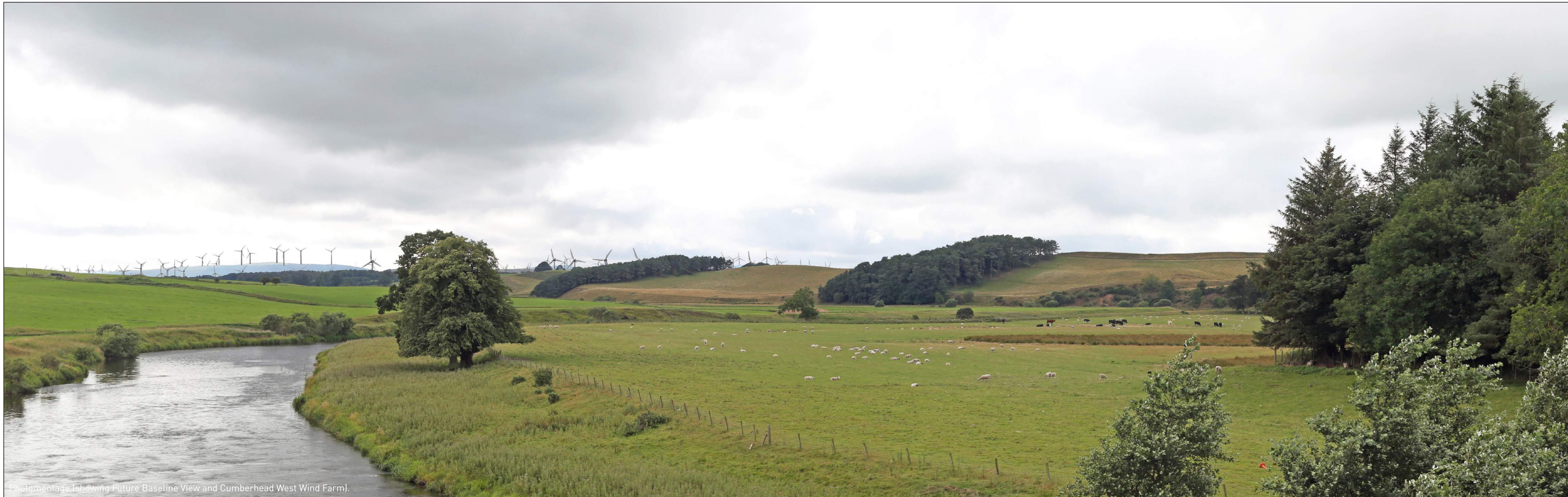
Photomontage (showing Future Baseline View and Cumberhead West Wind Farm).